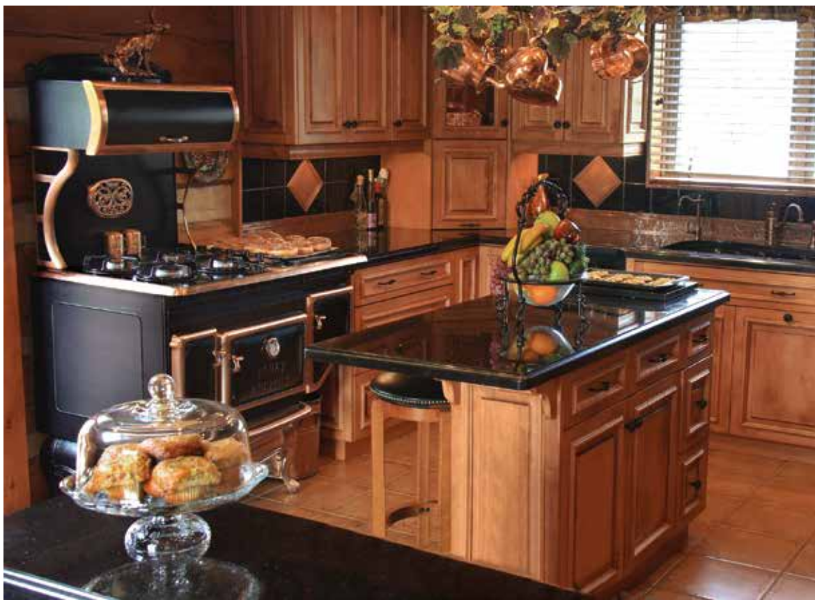
From Page 9

mirrors and antique curios such as old buckets and chairs to let your creativity run wild. A bucket makes a perfect toilet paper holder and the rungs of a forgotten old chair are ideal for an old-fashioned towel rack.